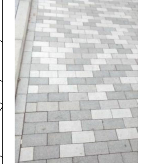
Concrete Block Paving - Grey Mix