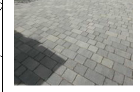
Tegula Setts - Pennant Grey