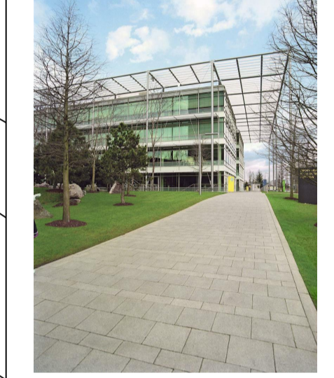
Conservation Textured Flag Paving